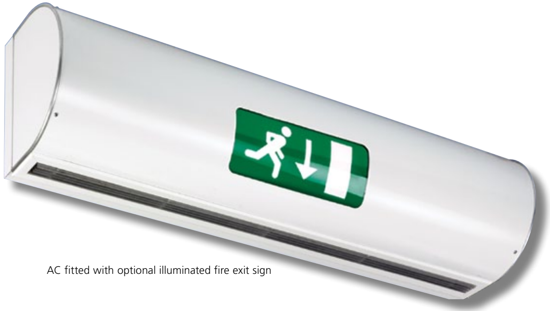
AC fitted with optional illuminated fire exit sign